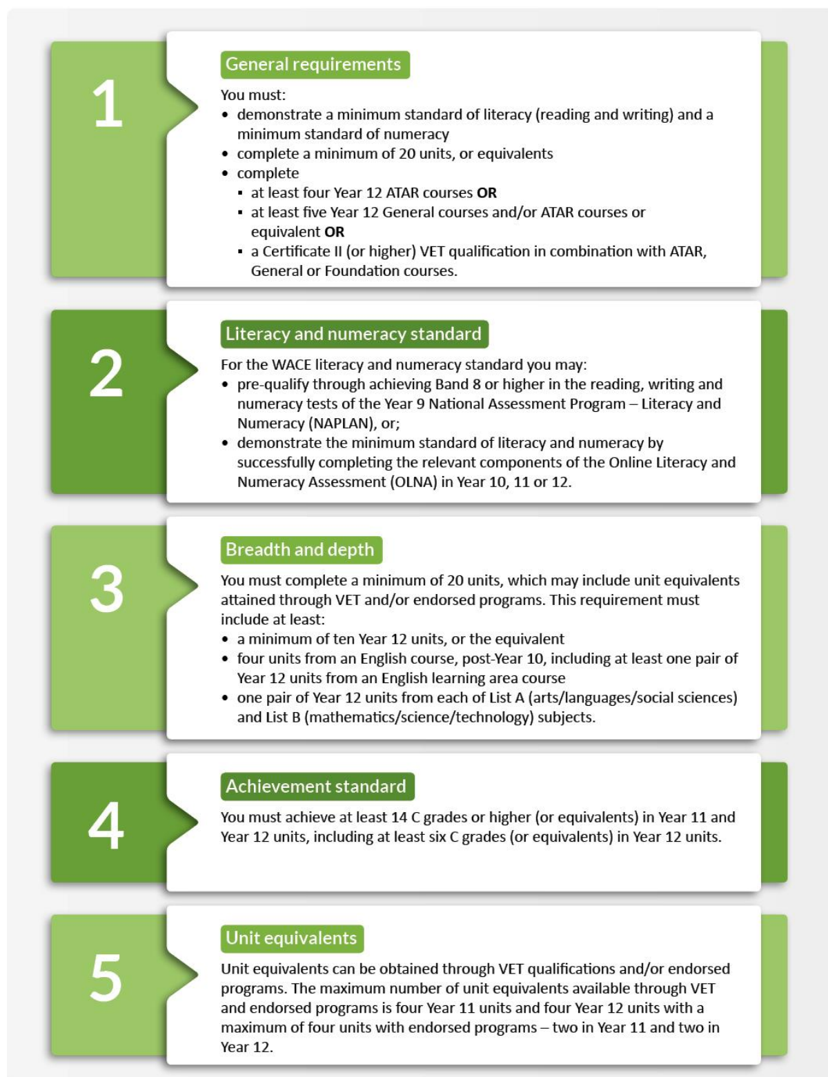
Figure 1. WACE requirements 2021 and beyond