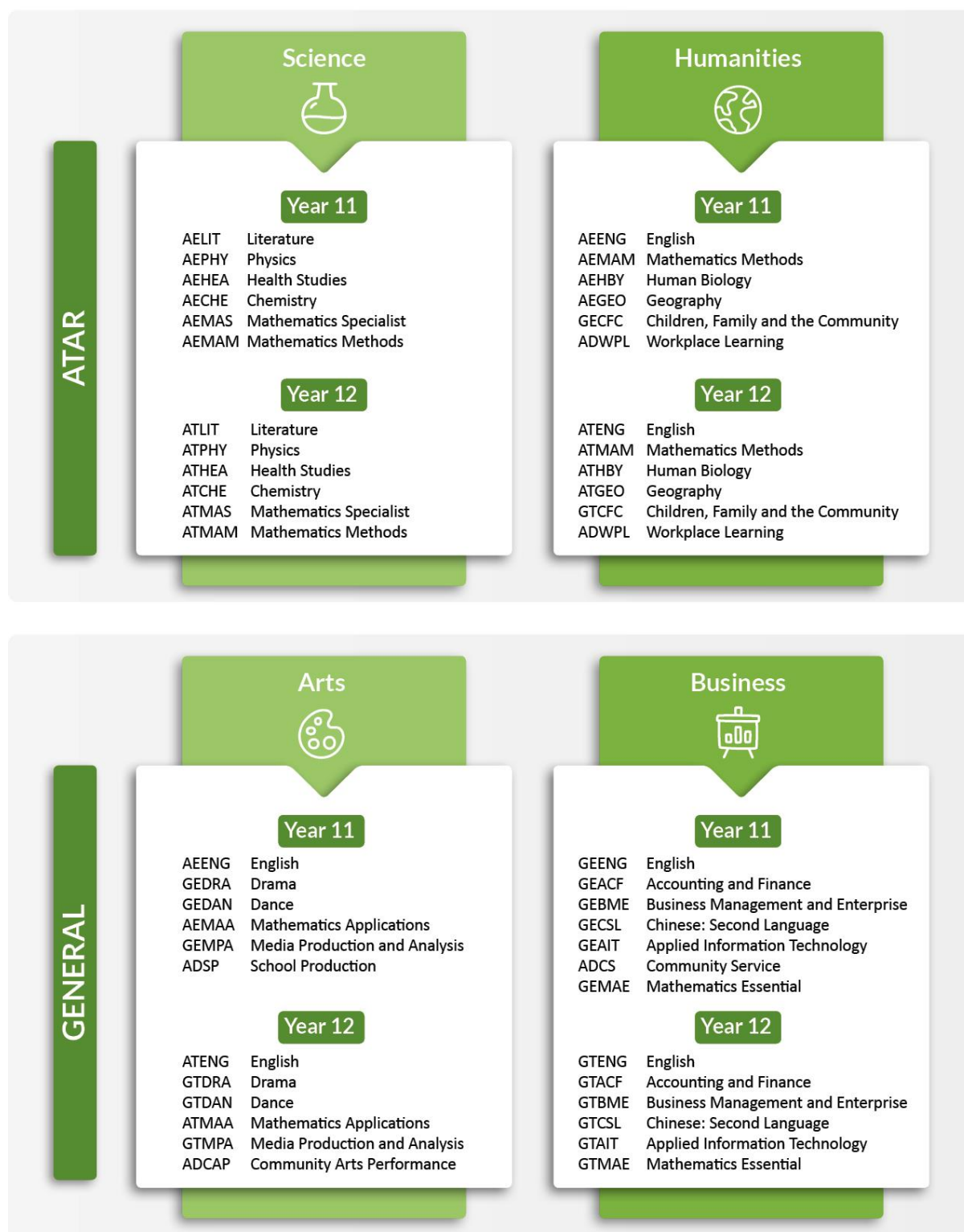
Figure 3. Sample programs – WACE 2021